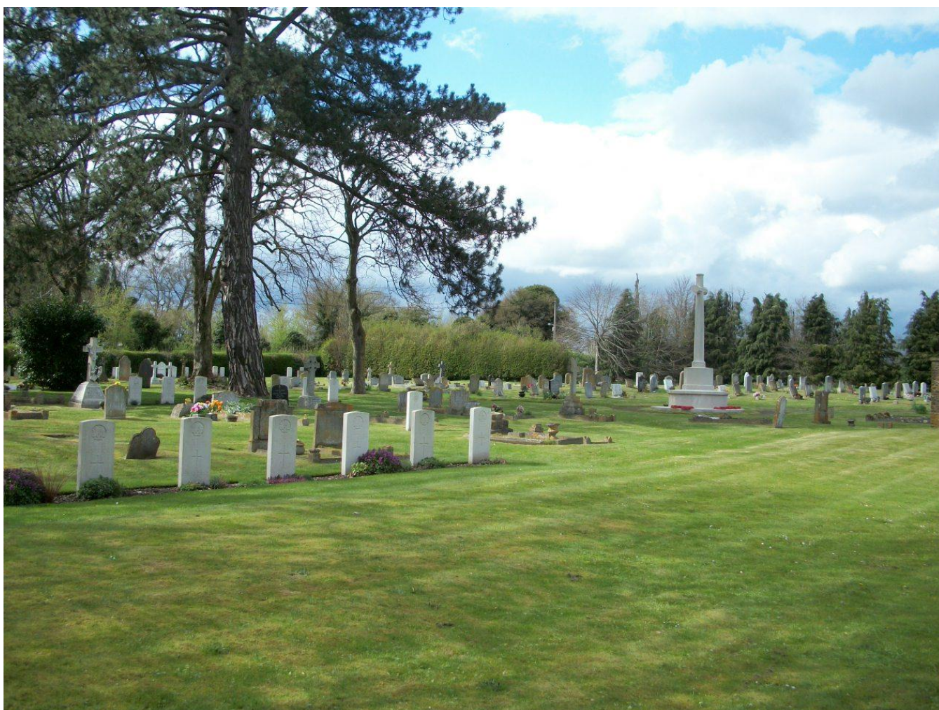
Bulford Church Cemetery